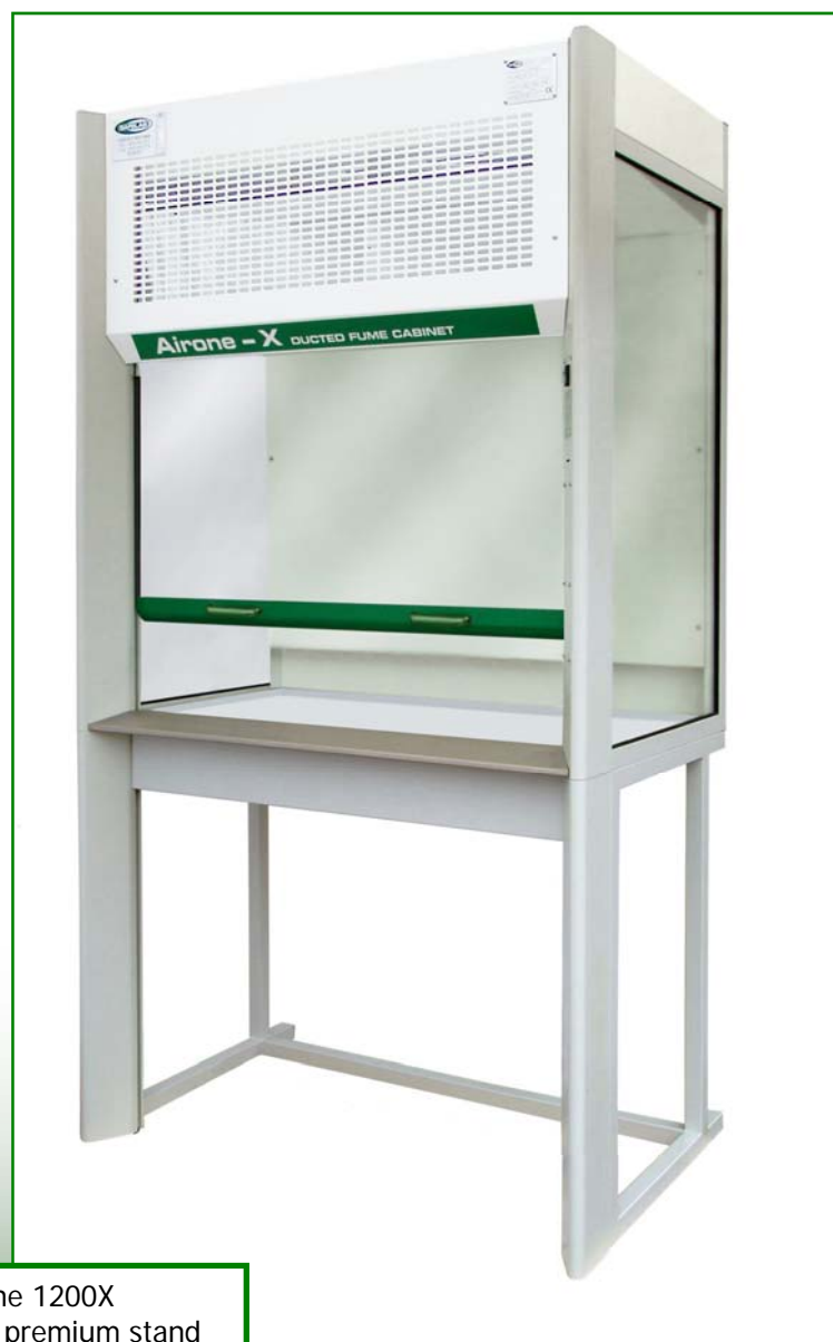
Airone 1200X with premium stand

Available in 4 standard widths, the units can be freestanding or bench mounted. A variety of standard options are available.